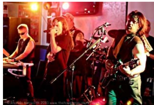
80 PROOF Performing at Time Out #1

Time Out #1 had a nice crowd going on last Saturday night and 80 PROOF's performance took us all back in time as we sang many of the 1980's rock hits with them.